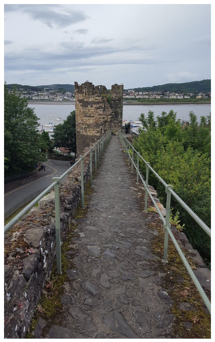
Conwy Town Walls, photo by Diane Jeffer, 2019