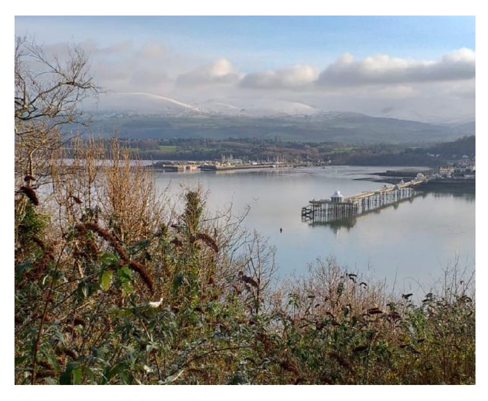
Snow capped mountains in Snowdonia with Bangor pier, taken from Anglesey