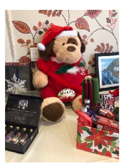
Dewi with AberFalls liquors and a box of Welsh Christmas goodies

The 2019 Christmas Luncheon took place on the first Saturday of December at the Storrowton Tavern in West Springfield, MA. The grounds and buildings of Storrowton Village were decked out for Christmas, but the best decoration was a blanket of snow-typical of December this year, a remarkably snowy month-which heightened the festive mood. Around 42 members and guests were in attendance; everyone, including newcomers and children, were welcomed with the customary warmth of the WSWNE. The beautifully appointed event room was a sea of red, the color that easily 90% of attendees opted to wear. After a merry social hour, we took our places at table and enjoyed a feast concluding with Christmas crackers, coffee, ice cream and Welsh cakes.