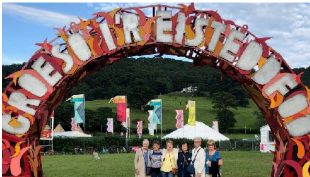
The 6 genealogists at the Eisteddfod.